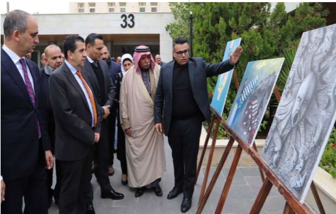
The impact of hate Speech on Social Peace: A Seminar at Al-Balqa Applied University