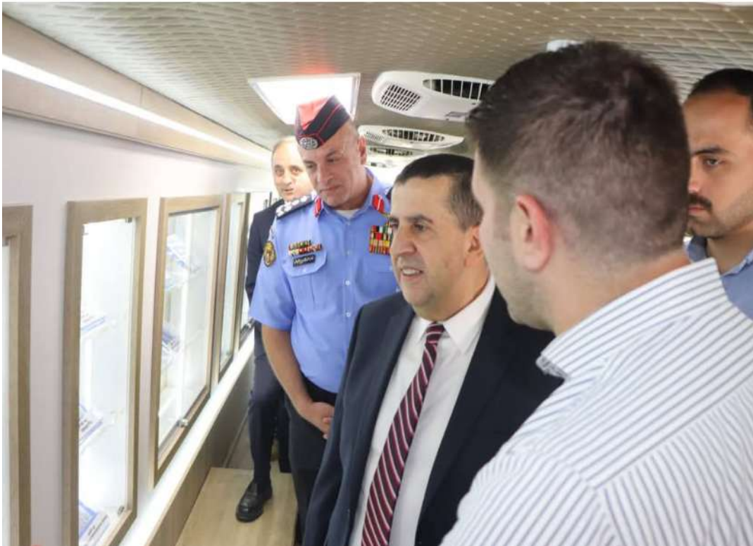
An awareness exhibition on the International Day Against Drug