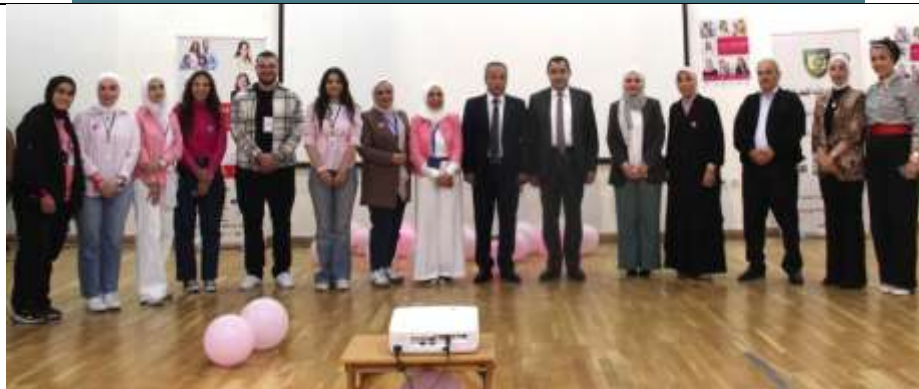
Health Awareness Day on Early Detection of Breast Cancer (Pink October Campaign) at Al-Balqa Applied University