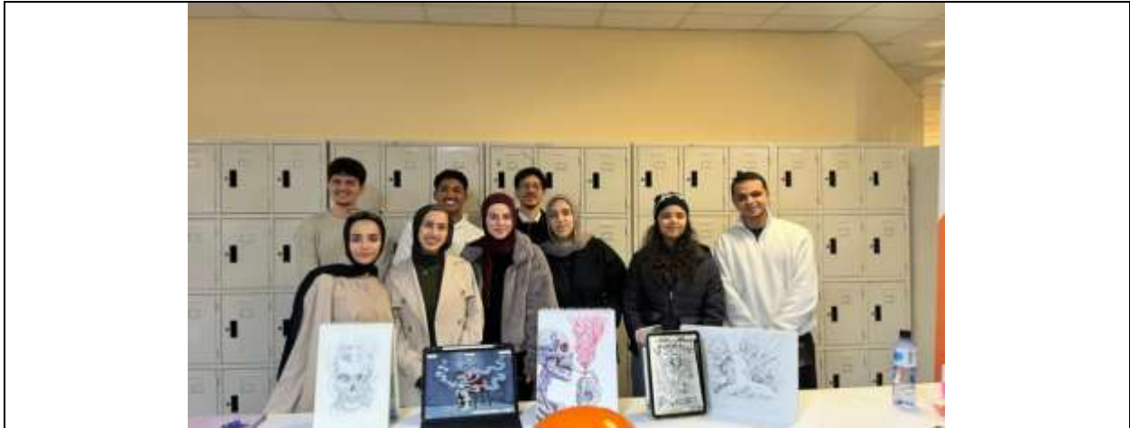
Awareness Day on the Health Risks of Smoking