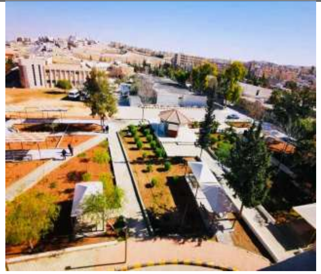
Sample of Open Space area