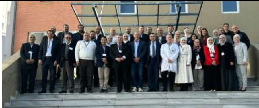
Faculty of Medicine Participation in an International Training Workshop on Clinical Educator Capacity Building in Greece