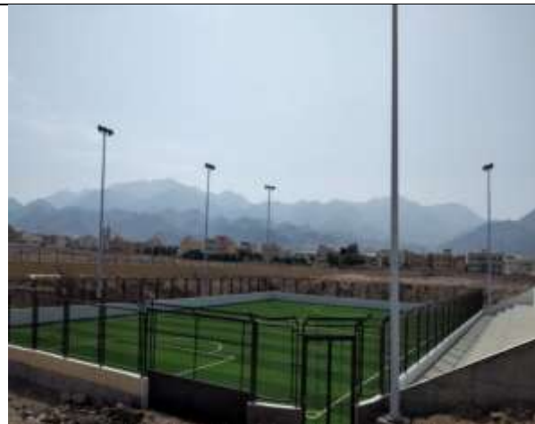
Sample of Sport Facilities