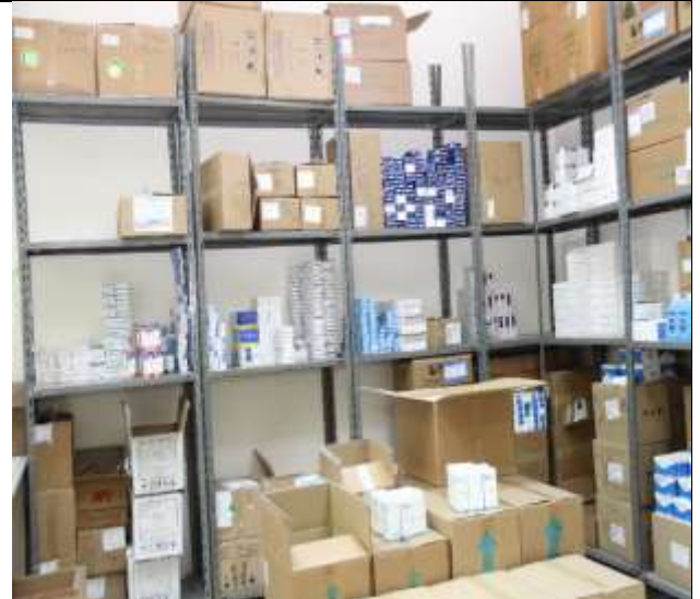
Pharmacy & medicine store at BAU