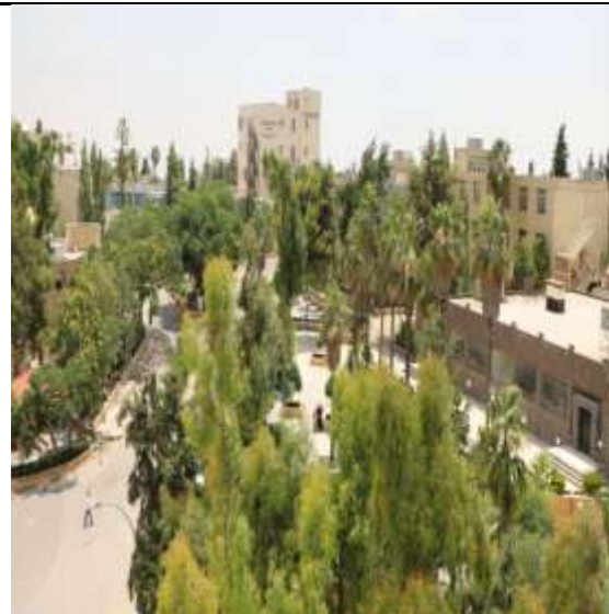
Sample of Open Space area