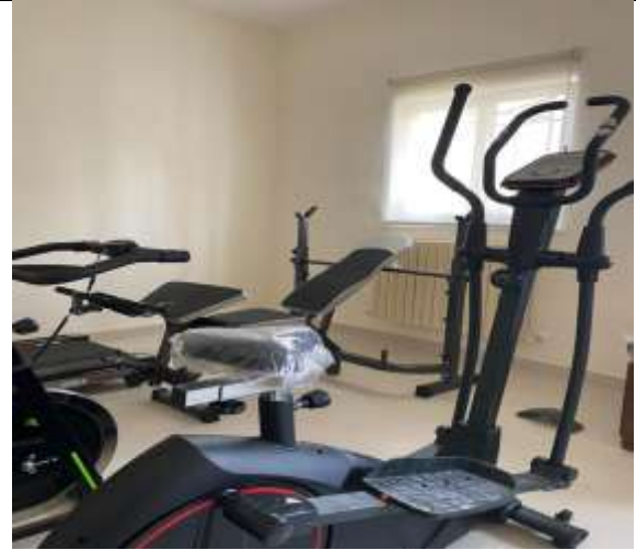
Female Dormitory accommodation