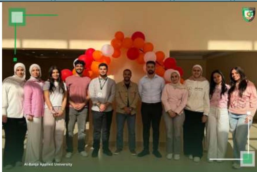
Awareness Lecture on Breast Cancer