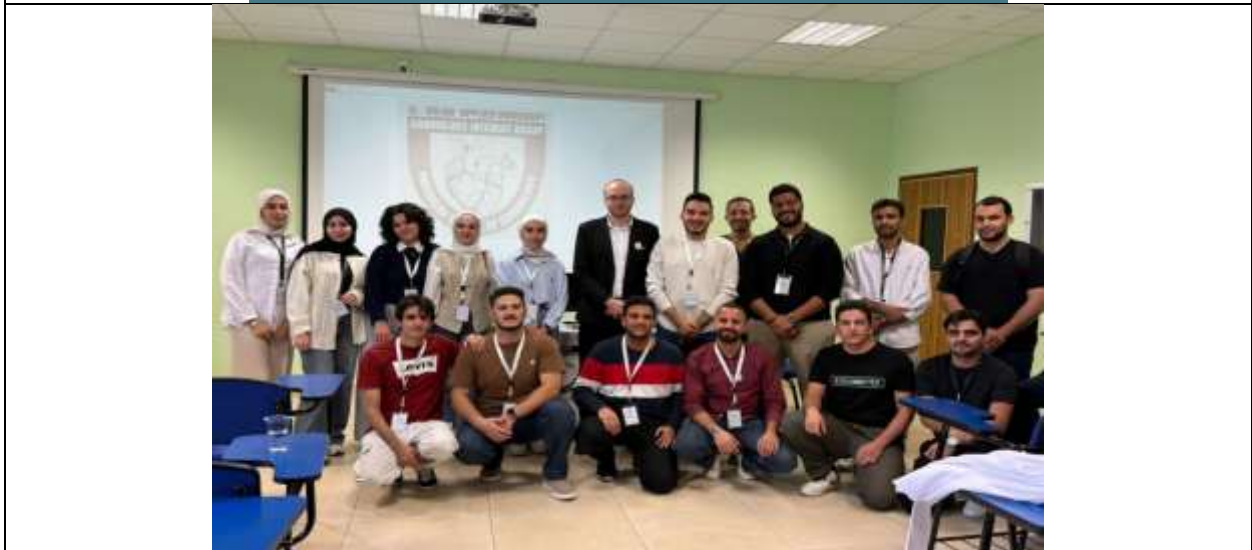
Hands-on Training Workshop on Electrocardiogram (ECG) Use