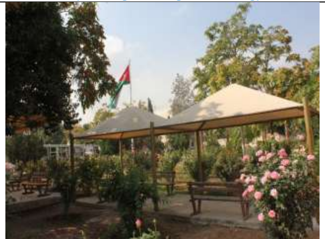
Faculty Of Engineering Park