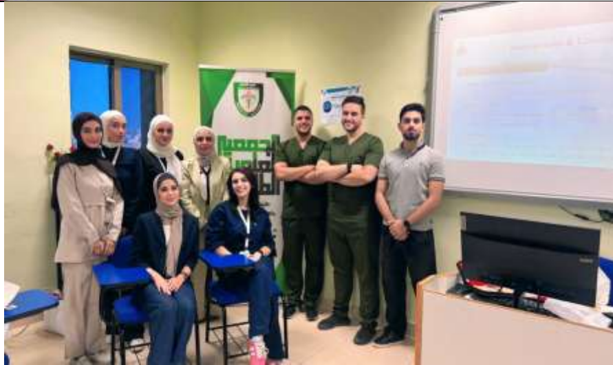
Practical Training Workshop on Basic Surgical Suturing Techniques