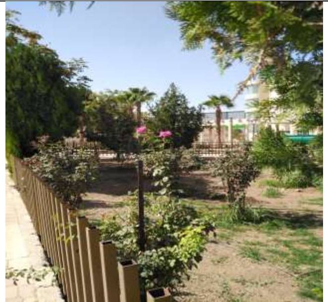
Faculty of Engineering Technology site