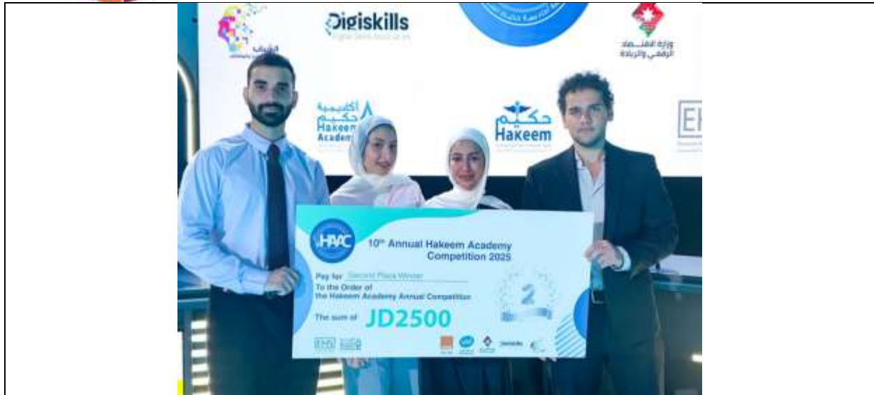
Medical Students at Al-Balqa Applied University Achieve Second Place in the Hakim Innovation Competition for Healthcare Innovation