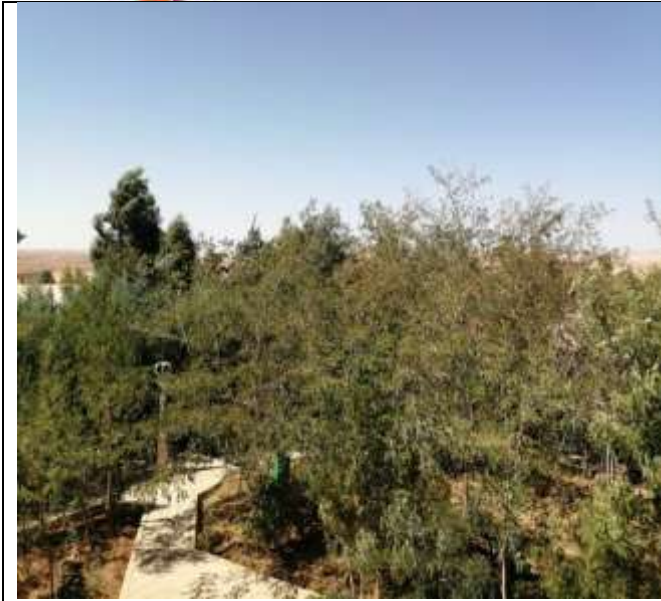
Maan campus site