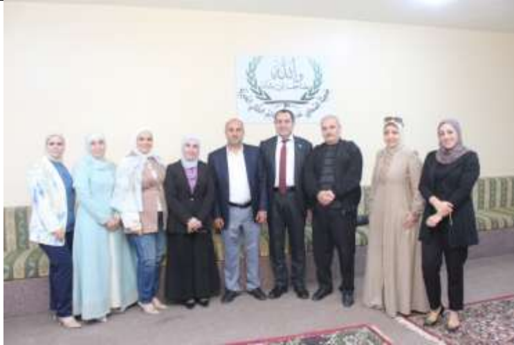
Sixth Free Medical Day Delivering Community Healthcare Services at Al-Balqa Applied University