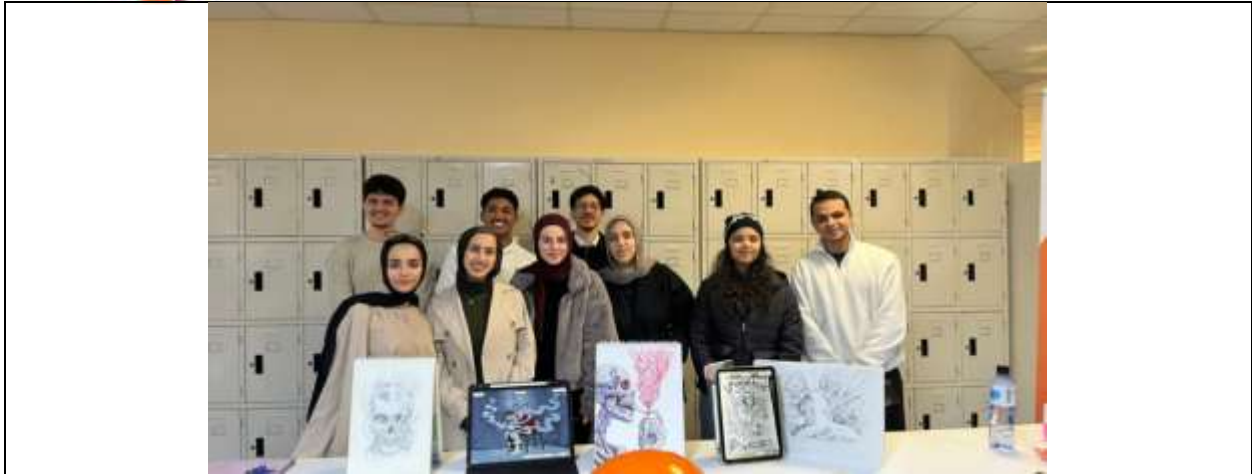
Awareness Day on the Health Risks of Smoking at the Faculty of Medicine, Al-Balqa Applied University