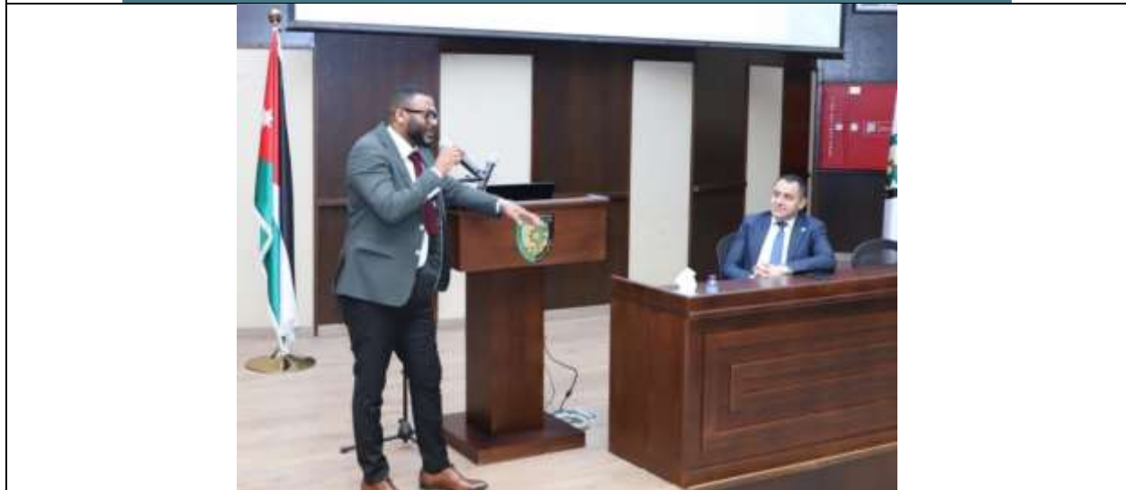
Advancing Healthcare Innovation: Expert Lecture on AI Applications in Gastroenterology by a Yale University Specialist at BAU