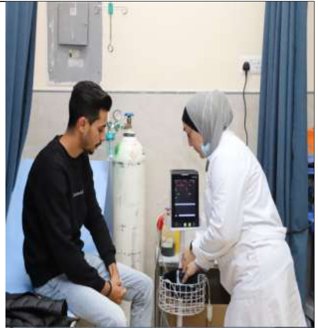
Main Campus's Clinic