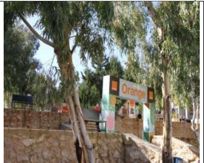
Orange and Zain Gardens