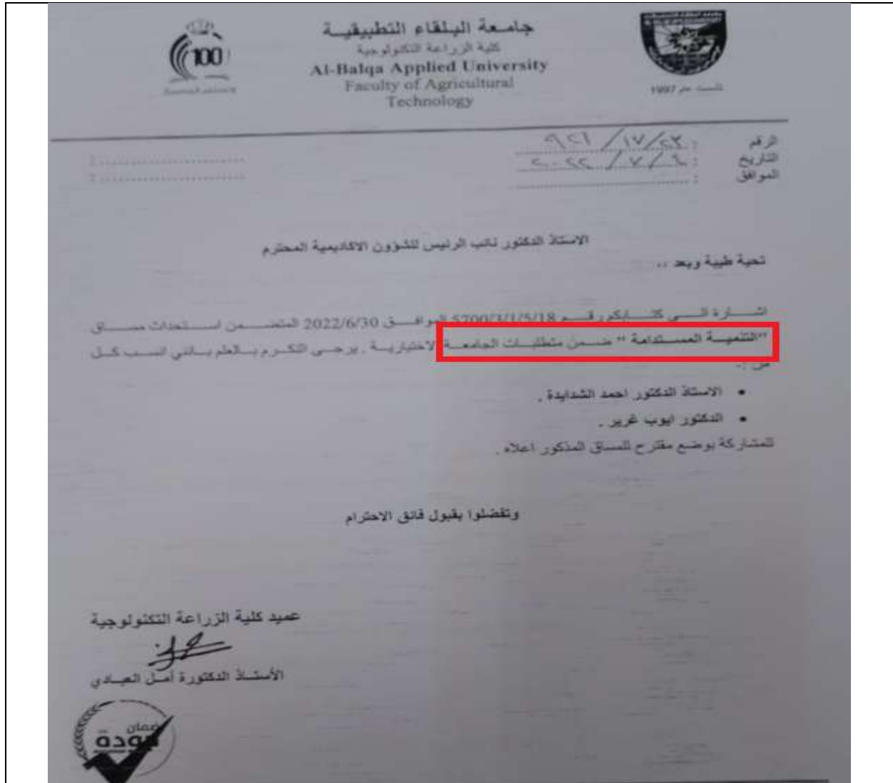
Introducing a New Course (Sustainable Development) as a one of the Obligatory University Requirements for All BAU's Students